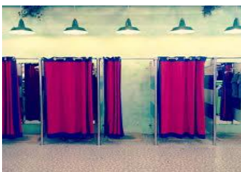
A fitting room