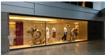
A shop window

Vocabulary : Words and expressions related to do the shopping (Mots et expressions relatifs aux achats de vêtements).